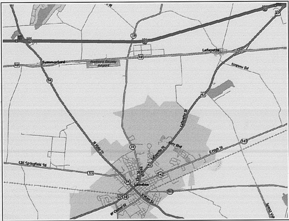
VICINITY MAP: NOT TO SCALE

PART OF VIRGINIA MILITARY SURVEY NUMBER 5802 CITY OF LONDON, COUNTY OF MADISON, STATE OF OHIO